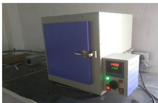
Figure 4: Copper strip apparatus

The apparatus we used is copper strip corrosion test apparatus. It is actually an Owen where we can change the temperature for the experiment. The apparatus consists of a boiling bath (100°C only) without stainless steel bomb and copper strips of definite size 6 bombs or 18 test tubes can be accommodate in each type of bath with different temperature regulation system to operate on 220 volts AC mains.