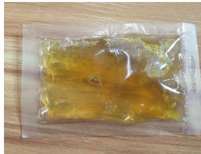
Figure 1: Grease sample

Grease is a semisolid lubricant. Grease generally consists of a soap emulsified with mineral or vegetable oil. The characteristic feature of greases is that they possess a high initial viscosity, which upon the application of shear, drops to give the effect of an oil-lubricated bearing of approximately the same viscosity as the base oil used in the grease. This change in viscosity is called shear thinning. Grease is sometimes used to describe lubricating materials that are simply soft solids or high viscosity liquids, but these materials do not exhibit the shear-thinning properties characteristic of the classical grease. For example, petroleum jellies such as Vaseline are not generally classified as greases. Greases are applied to mechanisms that can only be lubricated infrequently and where lubricating oil would not stay in position. They also act as sealants to prevent ingress of water and incompressible materials. Grease-lubricated bearings have greater frictional characteristics due to their high viscosity.