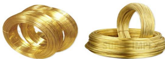
Figure 2: Brass wires

Brass with less than 15% zinc is supposed not to dezincification if left for long times in water. Brass should not be used in ammonia or nitrogen compound because of corrosive product form by brass in this environment and when it comes to machining, brass is much easier to cut than most ferrous materials. Brass is an excellent material choice for use in most industrial and agricultural application. Brass offers much better thermal conductivity and corrosion resistance than carbon or even stainless steel. Brass is an excellent material for use in both hot and cold water industrial and residential system including those carry portable water. Brass provides excellent resistance to corrosion in contact with petroleum products. Brass can be nickel plated to further reduce tarnishing and corrosion or to simply provide a silver finish. Nickel finishes may also be useful if a hard ware surface is required. Some examples of applications that are nickel plated for these purposes are door knobs, plumbing fixtures, gears and bearings.