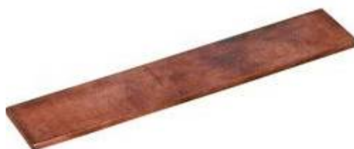
Figure 5: Copper strip