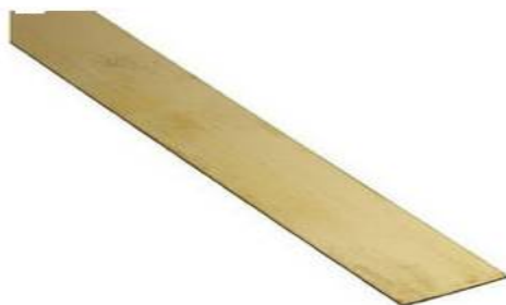
Figure 6: Brass strip